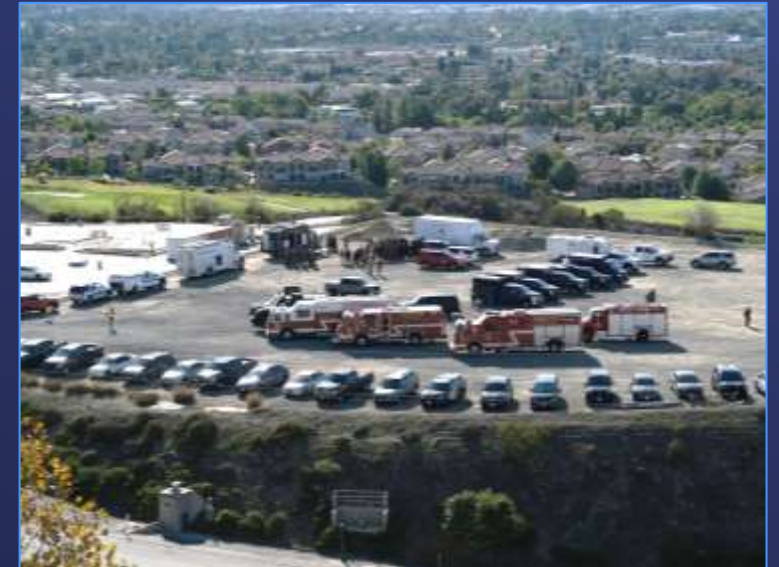
2022 Diemer Full-Scale Exercise