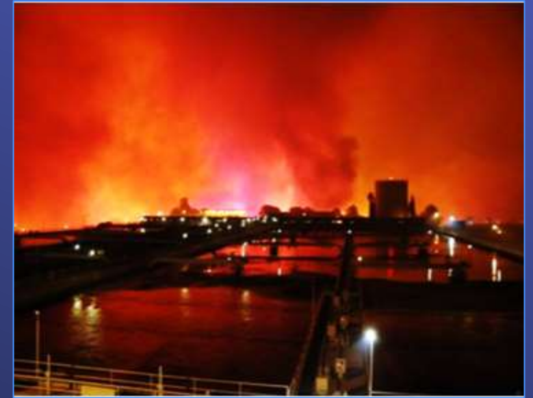
2008 Freeway Complex Fire