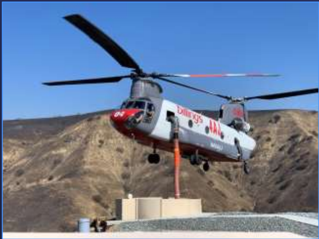
Open-Top Water Tank During Operation