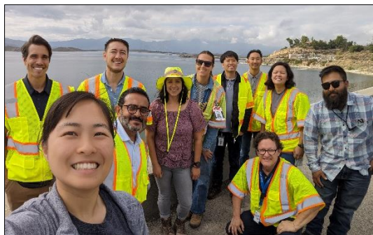
Plant engineer summit at Lake Matthews, fall 2023