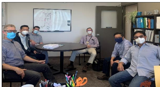
Former Diemer plant engineers' reunion, spring 2022

"My experience as a plant engineer has made me more thoughtful about how the construction of a project may impact operations and how to better mitigate the concerns."