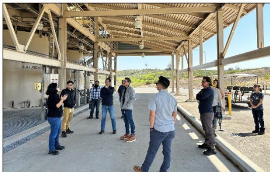
Plant engineers visiting the sulfuric acid tank farm at Skinner plant, spring 2024