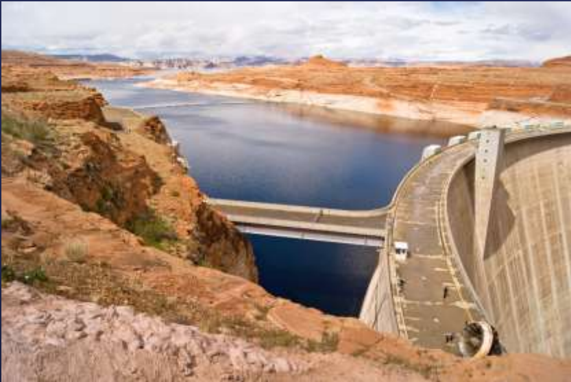
Powell Storage : 2 – 3 maf