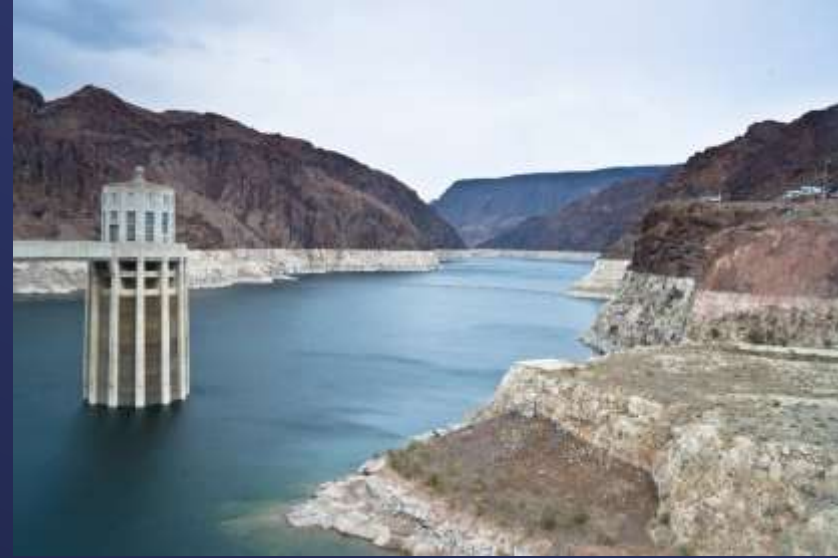
Mead Storage: 5 – 8 maf