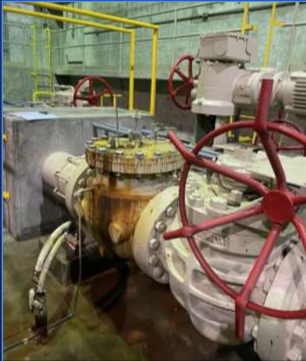
Failing Hydraulic Globe Valve