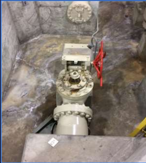
PCS Branch Line with Globe Valve Removed