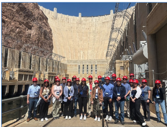
Visiting Hoover Dam with congressional staff

Nineteen congressional staff members joined Metropolitan on an infrastructure tour of the Colorado River and Southern California. The tour began at Hoover Dam, stopped in the Palo Verde Valley and Weymouth, and concluded at the Pure Water Southern California Napolitano Innovation Center. Along the way, Metropolitan staff highlighted operations and issues that staff works on in DC, including the Lower Colorado River Multispecies Habitat Conservation program and the Salton Sea. (April 22-25)