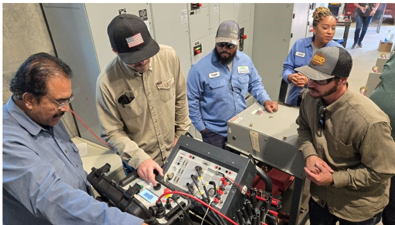
Electrical apprentices witnessing high voltage testing at Skinner

SRT Apprenticeship Programs prepare apprentices to become qualified mechanics and electricians responsible for maintaining Metropolitan's water treatment and distribution systems. This month, the Class of 2026 electrical apprentices visited the Robert A. Skinner Water Treatment Plant during a high-voltage distribution switchgear outage. Apprentices worked with experienced journeys to gain a first-hand understanding of high voltage equipment and testing procedures. The visit concluded with a facility tour conducted by the electrical team manager and former apprentice who emphasized the role electrical equipment serves in plant operations.