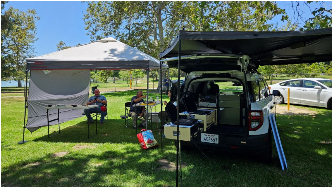
Mobile command post for the employee appreciation event in Whittier

On July 20, staff supported Security by setting up a mobile command post for the employee appreciation event in Whittier. This command post provided links to multiple resources and acted as a coordination point for Security personnel during the event. This also provided a solid field exercise for personnel to check equipment before actual deployment.