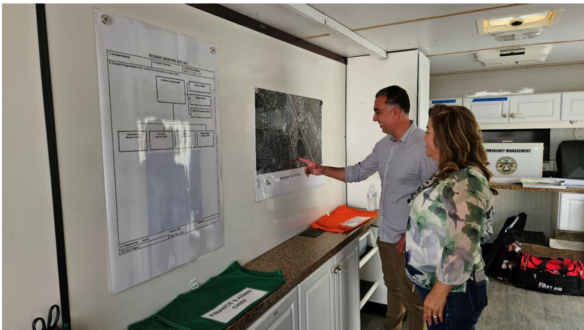
Emergency preparedness and the role of Metropolitan's Emergency Management Program were promoted at multiple safety fairs