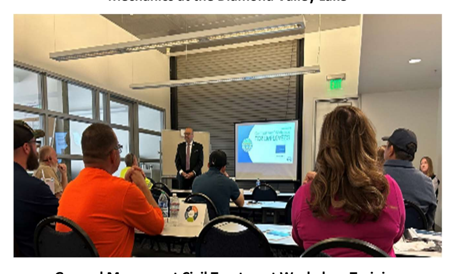
General Manager at Civil Treatment Workplace Training