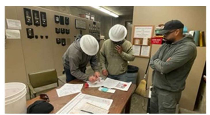
Staff performing High voltage switching practical operations (left) and reporting the completion of switching (right) at Coyote Creek HEP.