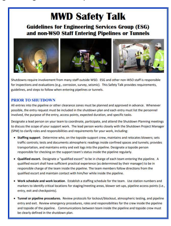
Metropolitan Safety Talk for Entering Pipelines and Tunnels

Technical guidance was provided to Engineering for Freda Siphon leak repairs during CRA shutdown. Suspect asbestos-containing materials were discovered on the interior of the siphon, which halted the completion of all planned Weko seal installations. Metropolitan's asbestos consultant conducted a comprehensive survey to identify each repair location containing asbestos for the future 2025 CRA shutdown. Staff will continue to partner with Engineering to establish procedures for installation of Weko seals without disturbing existing asbestos material.