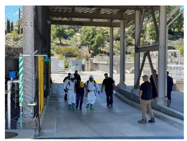
Jensen exercise drill to simulate chlorine leak and injury