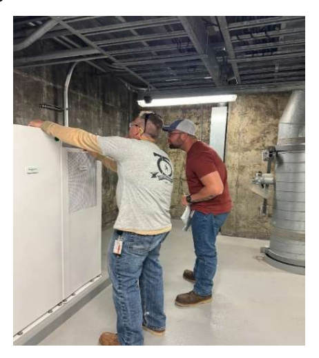
Mechanics at the Diamond Valley Lake

Lastly, staff facilitated the Civil Treatment Workplace Pilot Training in collaboration with Diversity, Equity, and Inclusion and Human Resources. The General Manager and Chief Diversity, Equity, and Inclusion Officer kicked off the meeting with opening remarks. Staff also partnered with External Affairs to facilitate the Colorado River Board meeting at the Apprenticeship Training Center.