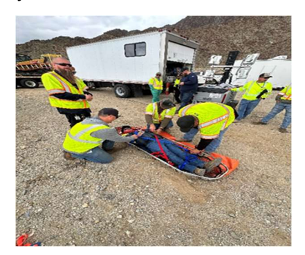
CRA ventilation blowers (left), CalOSHA pre-job meeting (center), and training on the use of Stoke's basket (right)