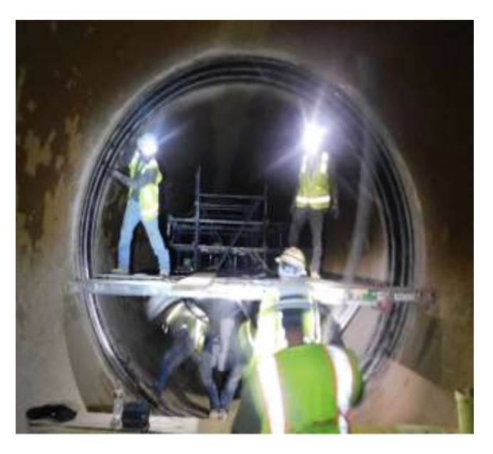
Freda Siphon Weko Seal Installation